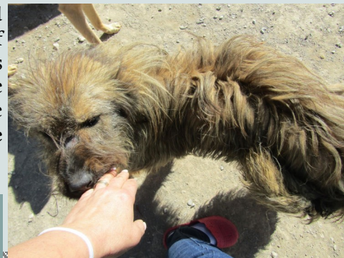
Right: Belle on the day we removed her from Rainbow Shelter