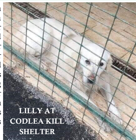
LILLY AT CODLEA KILL SHELTER