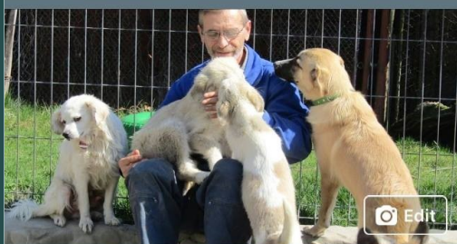
Group by RACE Romanian Animal Care Europe

RACE Romanian Animal Care Europe Adopters Forum >