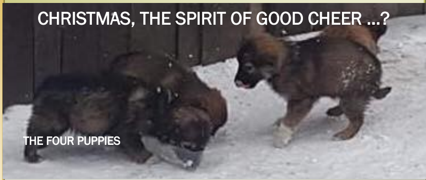
THE FOUR PUPPIES