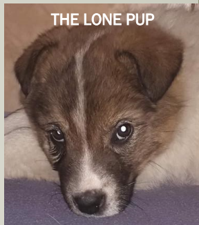
THE LONE PUP