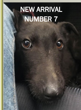
NEW ARRIVAL NUMBER 7