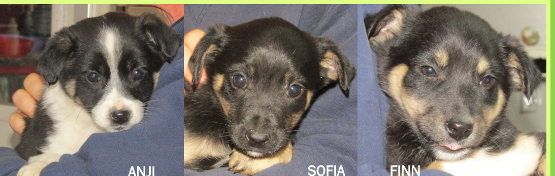
If you would like to make a donation towards the care of the puppies until they are old enough to be rehomed, our PAYPAL address is

minuses in Romania) in a cage with a blanket thrown over the top. Why? Because she didn't want a mess in her home! They were so very scared when Elena and Nelu collected them ... probably wondering what they'd done to deserve such an appalling start in life. They have all now received their first vaccinations, been wormed, deloused and are now being properly cared for. We'll be posting updates on our Facebook page over the next few days with some new photos to let you know how they are all getting along.