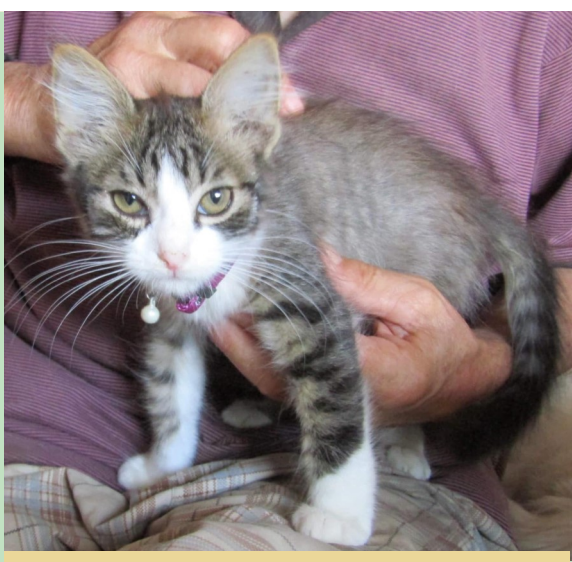
Puppies, small dogs, large This handsome little lad joined us back in late June ... meet Simba everyone. Our beautiful Bebe's brother. If only we still had our special girl here with him too. RIP Bebe.

This darling girl came to us from one of the public shelters in Romania (known to many as Kill Shelters). Unclaimed dogs are euthanised after the requisite period of time they remain unclaimed. There are many rescues that do their utmost to get the unclaimed dogs out of the shelters and find homes for them. sometimes dogs are thrown into kennels together ... fights break out where the bigger and stronger dogs will get what little food they all received. Puppies are at risk from deadly disease ... so you can