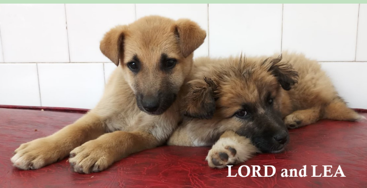
LORD and LEA

take the four babies on. However, she arranged temporary foster homes for each pair until some space was created once the adopted pups started travel. So here we introduce our four new babies who will be moving into Elena's in a couple of weeks time. Once they are old enough, we shall be looking for the perfect homes for them all.