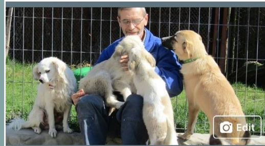
Group by RACE Romanian Animal Care Europe

RACE Romanian Animal Care Europe Adopters Forum >