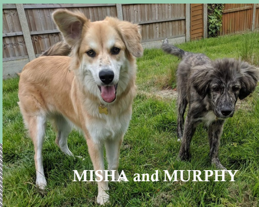
MISHA and MURPHY

Earlier this year, we thought another addition to our family was needed and seeing Haiduc was still looking for a home, my husband said "He's the one." In his photos he gave us the impression of a little dog with no purpose and we wanted to change that. We couldn't be happier that he's now our boy although it's time consuming training two puppies and making sure they both get attention, but with five adults in the house that isn't a problem. So both go puppy training and Murphy (was Haiduc) is making friends too. Misha and Murphy are total opposites, but adore each other - just as we adore them.