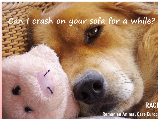
Can I crash on your sofa for a while?

Home check and references applies in all cases.